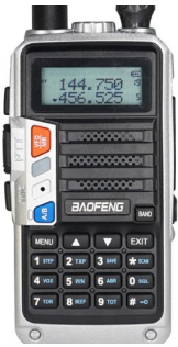
CQ MKARS, CQ MKARS ...